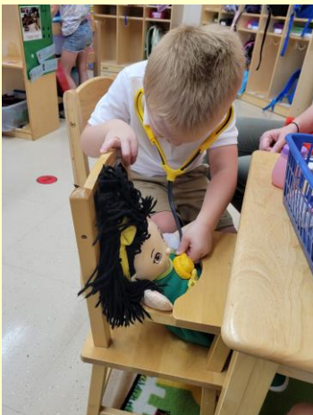
Hunter is using a stethoscope to check the doll's heartbeat.