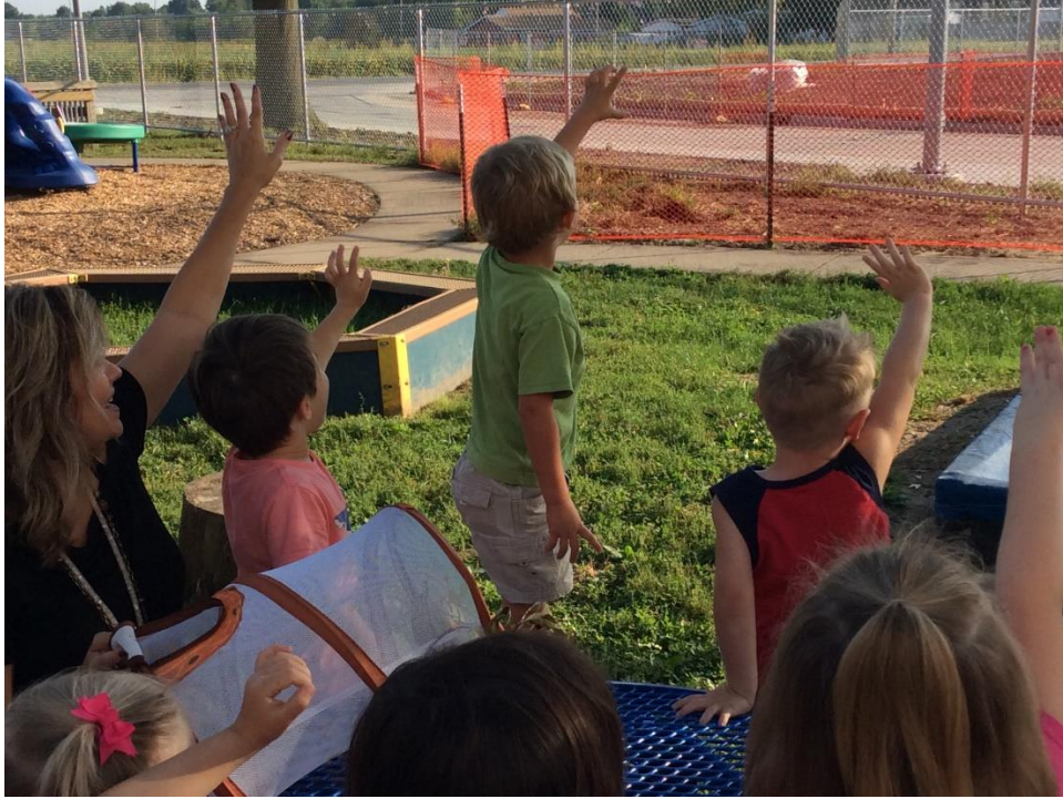
Waving goodbye to Big Willie!